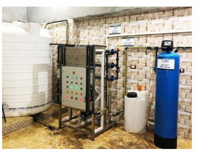
15 m3 \ day - El Sharqia