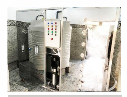
40 m3 \ day - El Minya