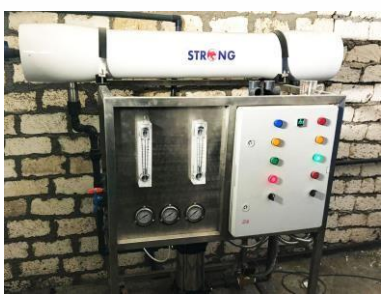
25 m3 \ day - El Minya