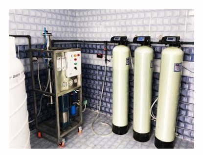
5 m3 \ day - El Menoufia