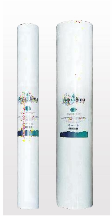
300 gm 900 gm