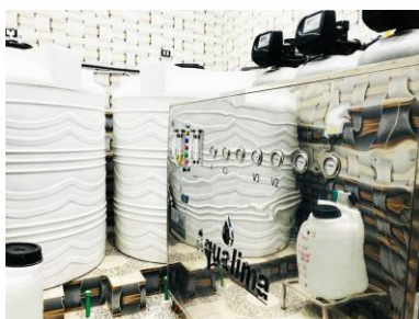
80 m3 \ day - El Sadat