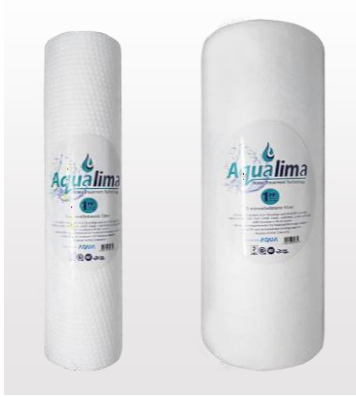
150 gm 450 gm