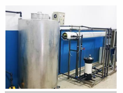
75 m3 \ day - Palestine