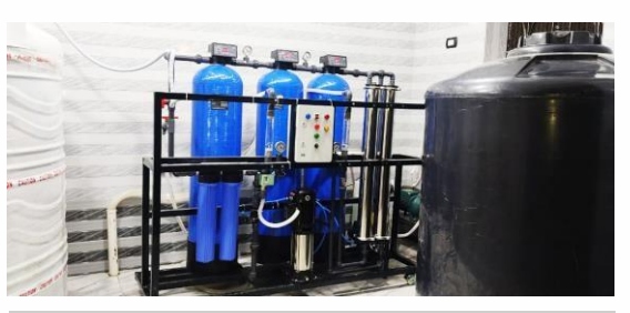
10 m3 \ day - El Gharbiya