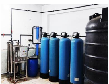
20 m3 \ day - El Menoufia