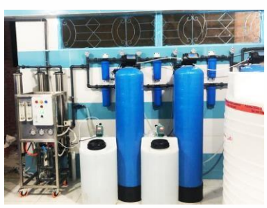
15 m3 \ day - El Menoufia