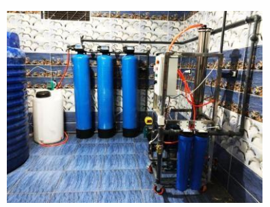
5 m3 \ day - El Behira