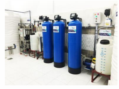
20 m3 \ day - El Menoufia