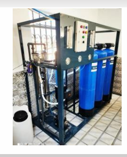
10 m3 \ day - El Fayoum