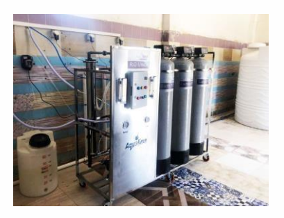
10 m3 \ day - El Bahariya Oases