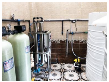
10 m3 \ day - Kafr El-Sheikh