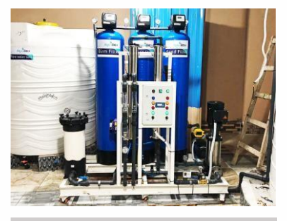
10 m3 \ day - El Menoufia