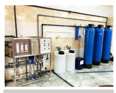
15 m3 \ day - El Gharbiya