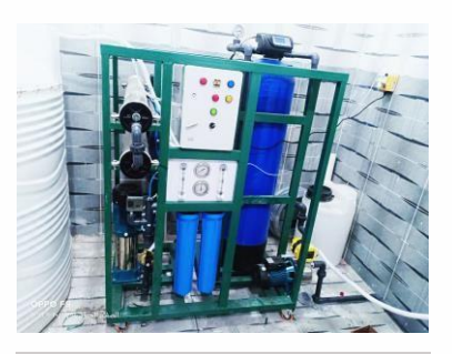
10 m3 \ day - Cairo