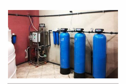
10 m3 \ day - El Mansoura