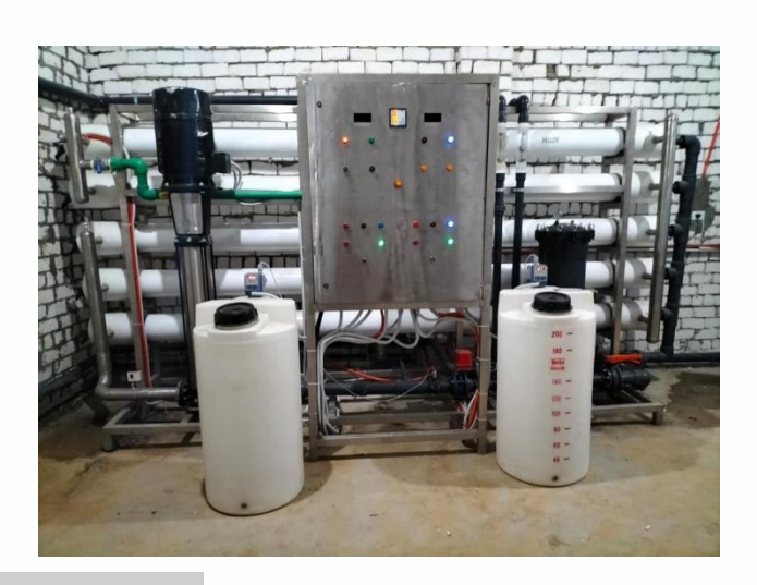
500 m3 \ day