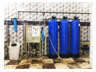
20 m3 \ day - Sohag