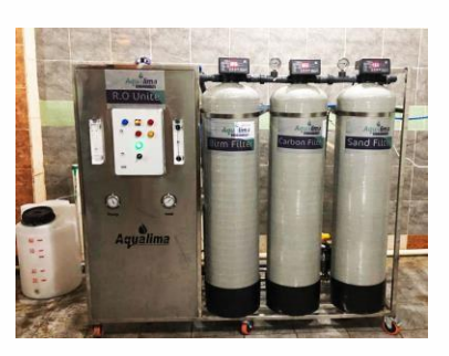
10 m3 \ day - El Bahariya Oases