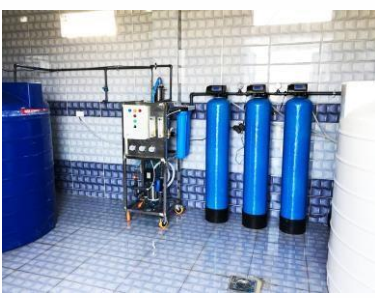
5 m3 \ day - El Behira