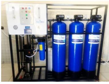
20 m3 \ day - El Fayoum