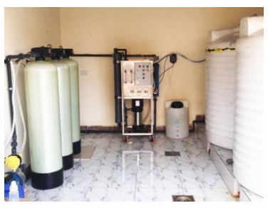
15 m3 \ day - El Gharbiya