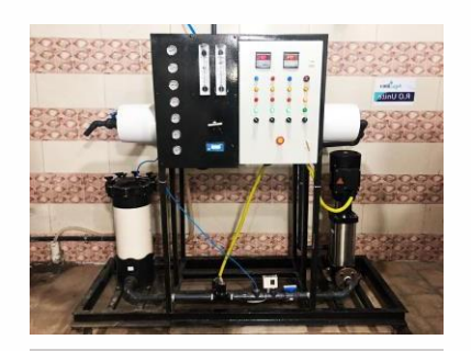
25 m3 \ day - El Menoufia