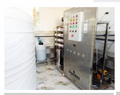
20 m3 \ day - El Minya