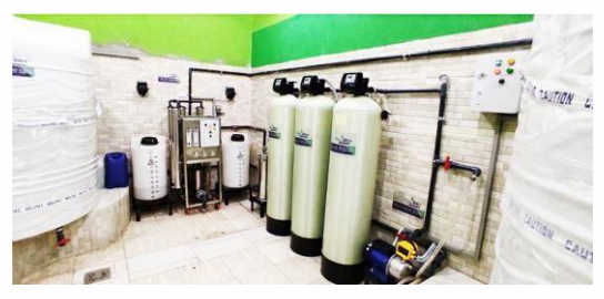
20 m3 \ day - El Sadat