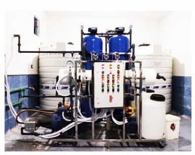
20 m3 \ day - El Behira