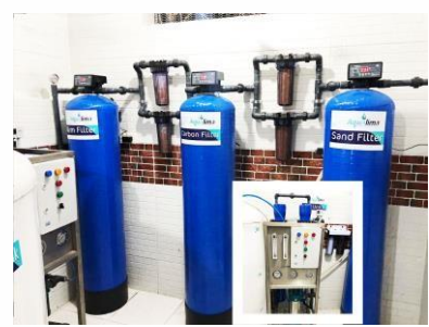
10 m3 \ day - El Menoufia