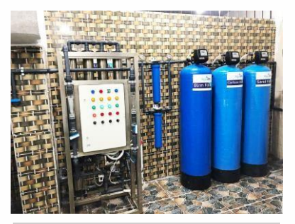
20 m3 \ day - El Menoufia