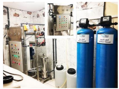
10 m3 \ day - El Menoufia