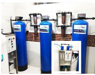
10 m3 \ day - El Menoufia