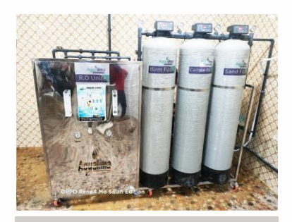
20 m3 \ day - Cairo